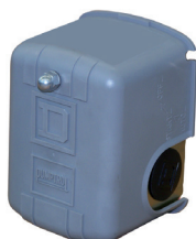
Pressostato Pressure switch