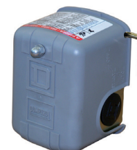
Pressostato di sicurezza a riarmo manuale "Square D" "Square D" safety manual resetting pressure switch