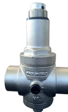
Riduttore di pressione Pressure reducer